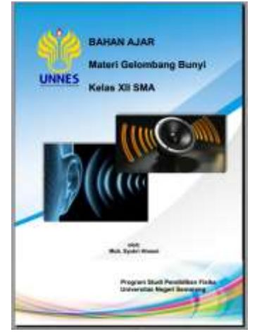
Figure 1. Cover of sound wave teaching material

This research produces a product in the form of sound wave teaching materials to improve problem solving skills and student performance. Teaching materials consist of electronic books in the form of PDFs that can be opened directly through a smartphone or PC or can be printed into a book. The initial stage begins with a literature study on the development of electronic book-making software and its use. The next stage is the initial product design. The initial product design begins with making and choosing a design. The electronic book produced has three parts, namely the beginning of the cover, preface, usage instructions and table of contents. The second part is the content in the form of sound wave material equipped with examples in everyday life, questions at the end of each material, as well as illustrations in the form of images, videos, and simulations. At the end there is a reading and reference list.